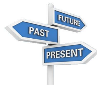
World Connector Market Handbook

Bishop and Associates has just released the 2021 edition of the World Connector Market Handbook. This comprehensive seven-chapter, 229-page report analyzes all aspects of the world electronic connector market. This report provides detailed connector statistics by equipment sector and product category for North America, Europe, Japan, China, Asia Pacific, and the ROW region. Included is a complete chapter on worldwide connector industry results by region, equipment sector, and product category. Data is provided for the years 2011 – 2020, and projections for 2021 and 2026 (including five-year CAGRs).