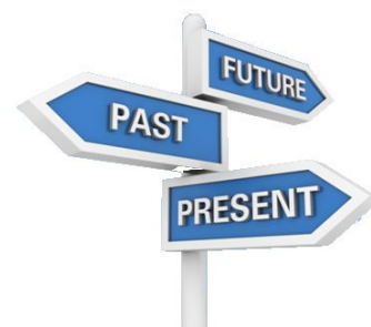
World Connector Market Handbook

Bishop and Associates has just released the 2022 edition of the World Connector Market Handbook. This comprehensive seven-chapter, 230-page report analyzes all aspects of the world electronic connector market. This report provides detailed connector statistics by equipment sector and product category for North America, Europe, Japan, China, Asia Pacific, and the ROW region. Included is a complete chapter on worldwide connector industry results by region, equipment sector, and product category. Data is provided for the years 2012 – 2021, and projections for 2022 and 2027 (including five-year CAGRs).