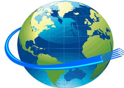
2022 World Cable Assembly Market

The 2022 World Cable Assembly Market report offers an in-depth analysis of this growing and thriving industry. The worldwide cable assembly market will grow at a compound annual rate of 6.0% from 2022 to 2027. We are at the beginning of a period of high inflation, unstable world order, and slowing GDP growth unsettling the economies of the world. Regional GDP growth and regional market sector performance were primary drivers for the projections of the industry contraction/growth. Worldwide market share in the cable assembly market is beginning to stabilize and the shift overseas has slowed. The fastest growing market segment is Telecom/Datacom with a five-year CAGR of 7.5%. This market growth is primarily the result of the need for expanded network infrastructure and conversion to 5G. The automotive market, the largest cable assembly market sector, will also continue to grow as the semiconductor shortages being resolved, and will spur growth in the industrial sector during the forecast period. After two decades of strong growth, China's cable assembly industry is now the largest in the world holding a market share of 30.8% in 2021. Will China continue to grow, however?